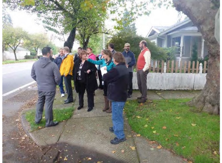
Community members and advocates organized worked with city staff and decision-makers to determine which features would make the greenway safe for people to bike and walk.