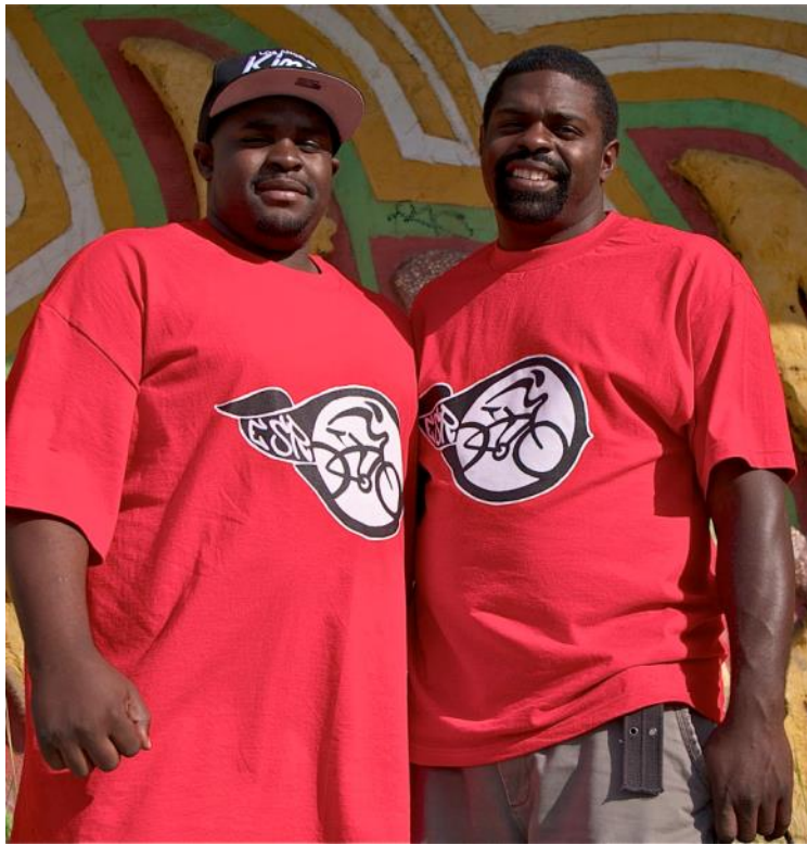
East Side Riders BC, Watts area, Los Angeles