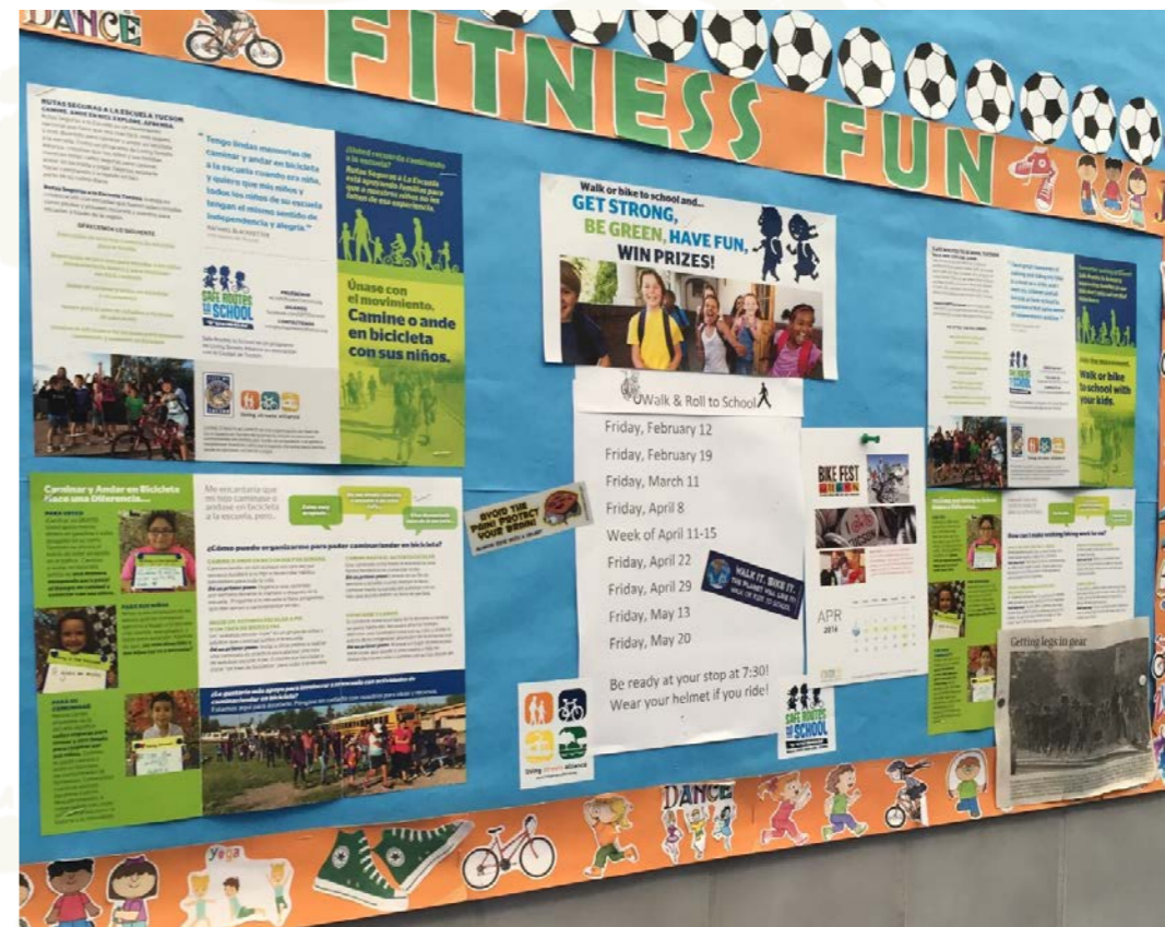
Office bulletin boards and parent handbooks are a good way to institutionalize regular bike train routes.