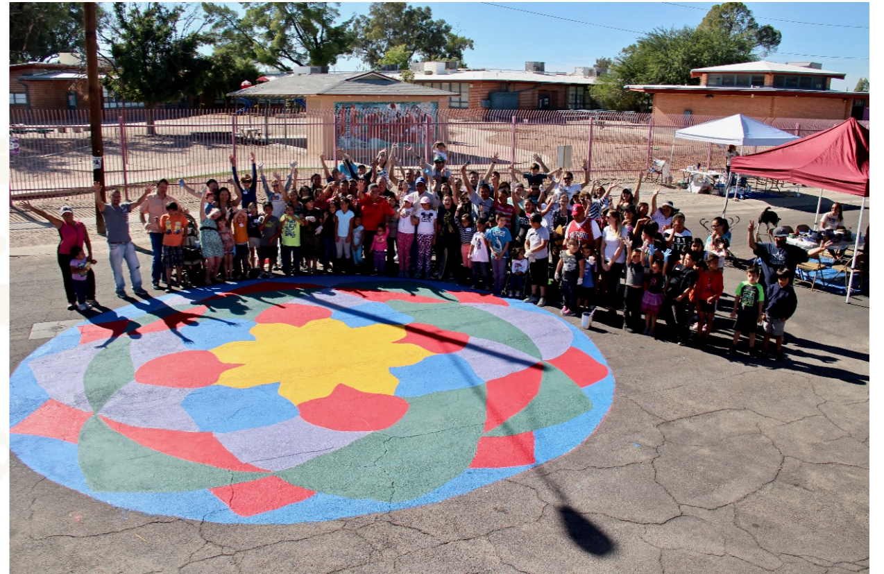
Intersection murals painted by Pueblo Gardens community