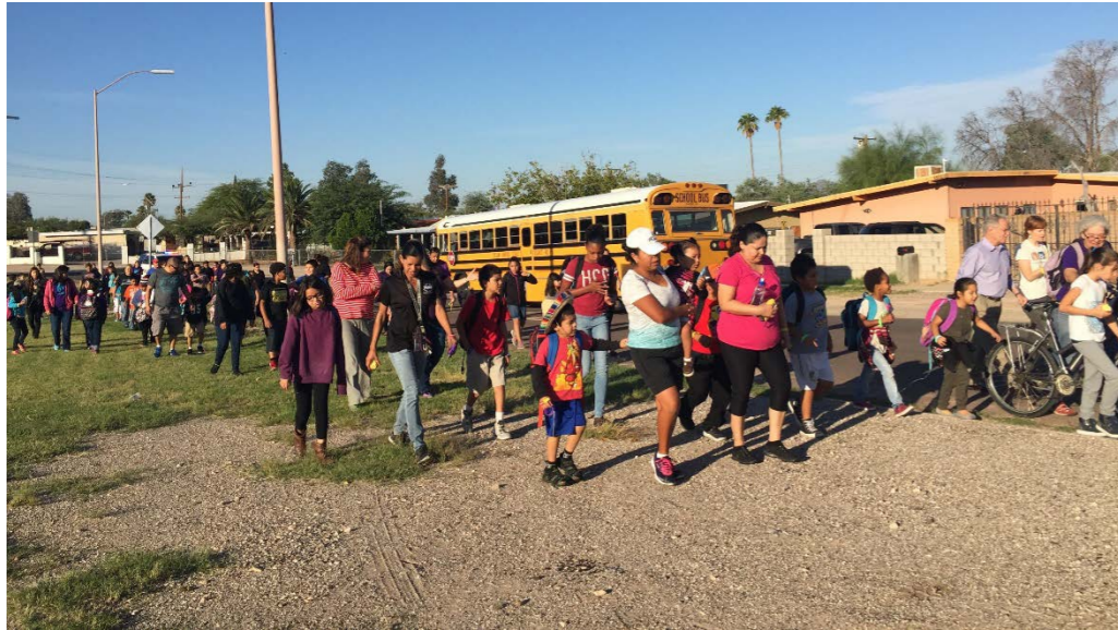
Walking N Rolling with City and County Officials