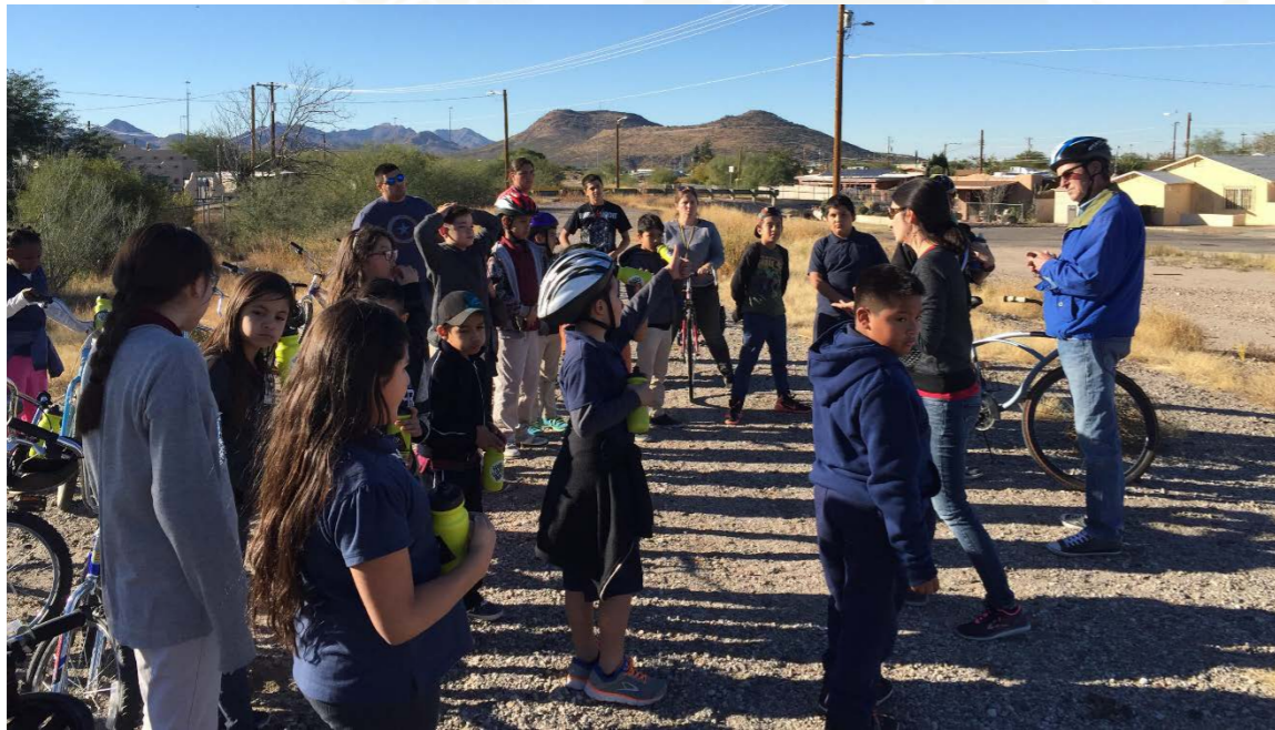
South Tucson Bike Club talking to city planners about future greenway project