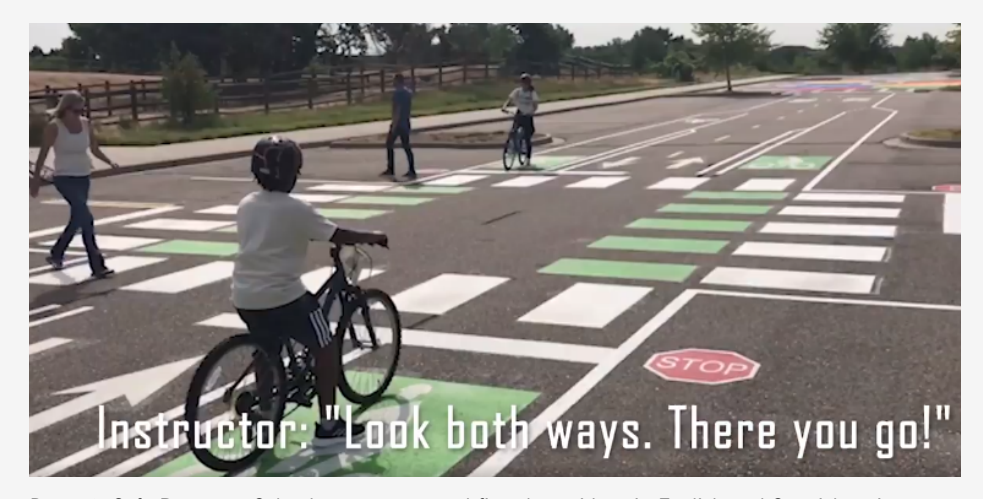
Denver's Safe Routes to School program created five short videos in English and Spanish to instruct people of all bicycling levels how to ride safely.

In New York City, every year Bike NYC trains NYC parks and recreation staff on how to run Learn to Ride classes. Bike NYC provides the tools necessary for the classes and handles registration and customer service. Parks and recreation staff then schedule and run their own Learn to Ride classes for kids citywide.