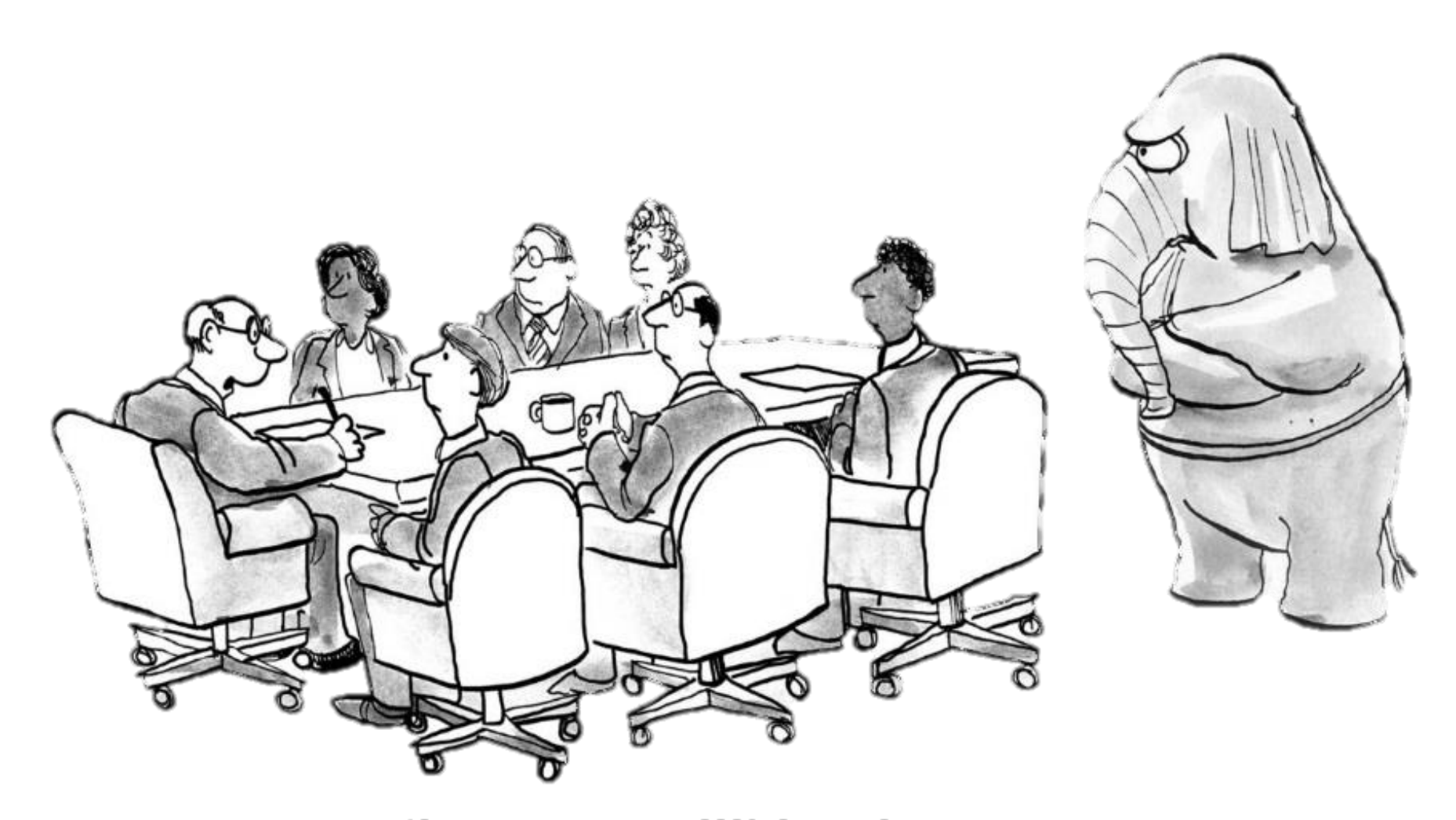
'I suppose I'll be the one to mention the elephant in the room."