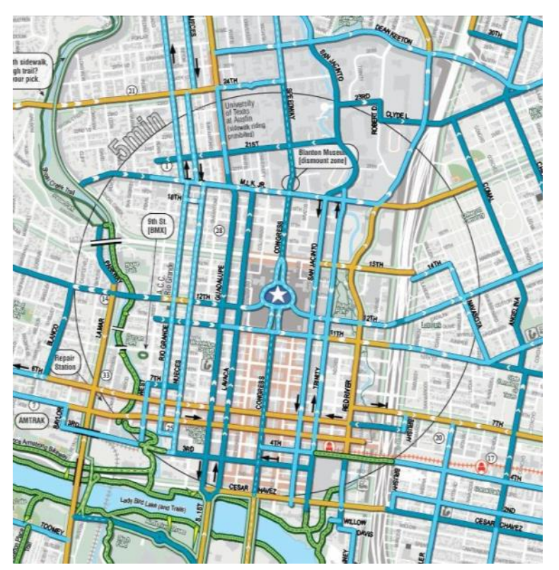
Bike Map OF Austin, Texas