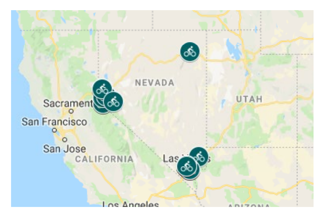
Schools registered for Bike to School Day in May 2019